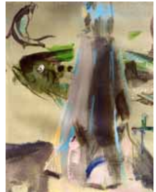
"Ghandi and Abdul Ghaffar Khan"