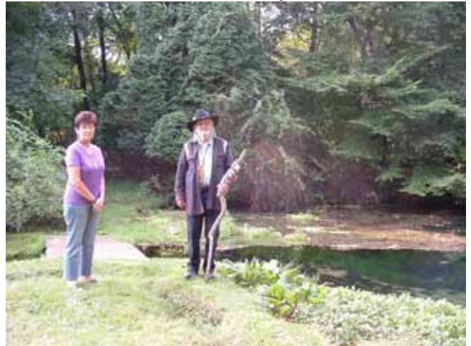
Nokomis - Many Crows at Spring

Individual works are copyright © by their respective creators. No poem/prose may be reproduced without express permission by the author.