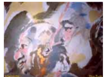
Oil paintings by Elaine Restifo

Next meeting of Artsbridge/River Poets: December 10, 2005